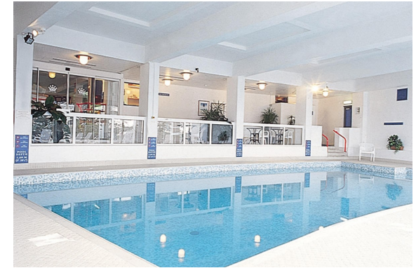
Indoor swimming pool