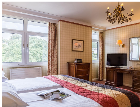
A Standard double with inland view