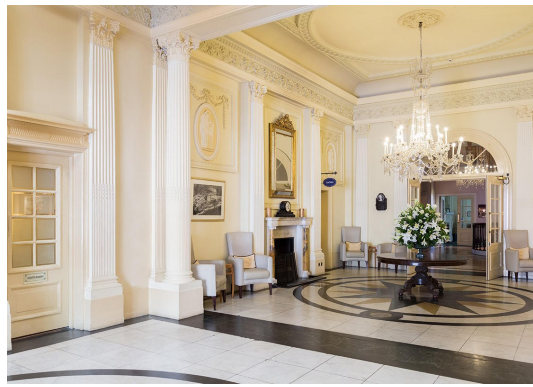
Magnificent marble reception area

42 Ardleigh Green Road, Hornchurch RM11 2LG