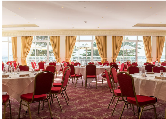
The Restaurant with views across Torbay